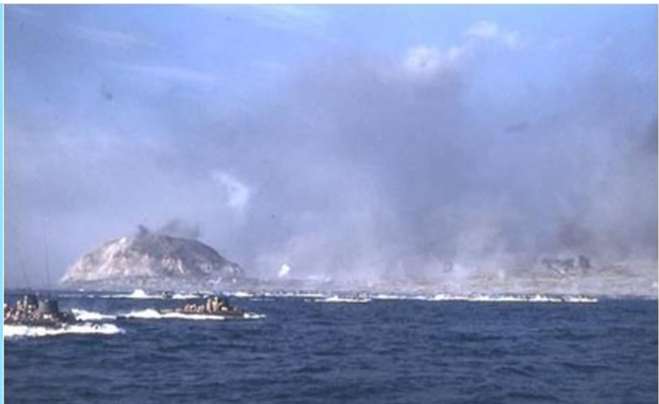
Amphibious tractors approaching Iwo Jima, February 1945

The following are the notification and recognition of his service: